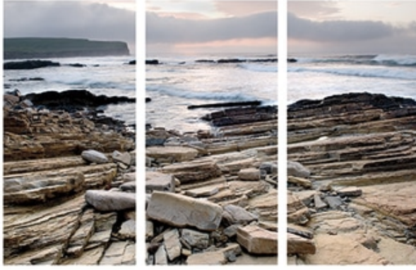
Sunset on Brough Head North Coast of Orkney Islands (Orkney Islands Scotland)