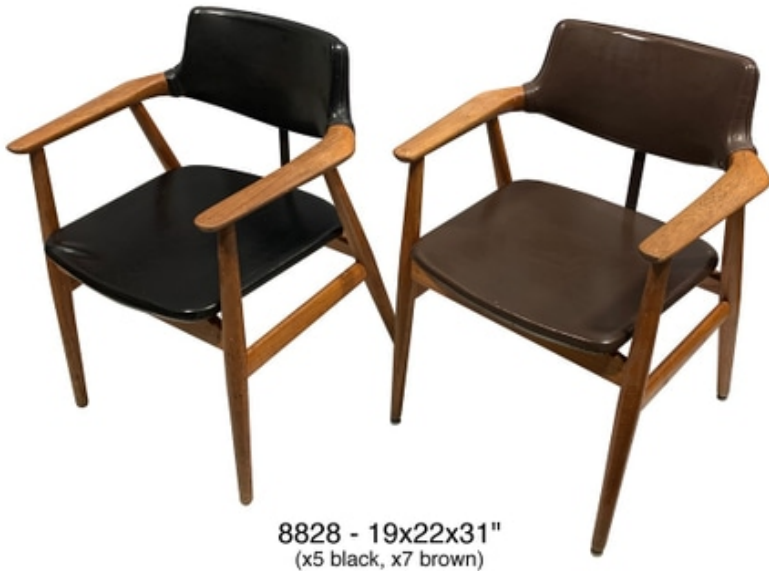
8828 - 19x22x31" (x5 black, x7 brown)