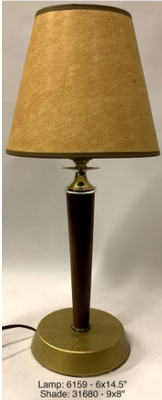
Lamp: 6159 - 6x14.5" Shade: 31680 - 9x8"