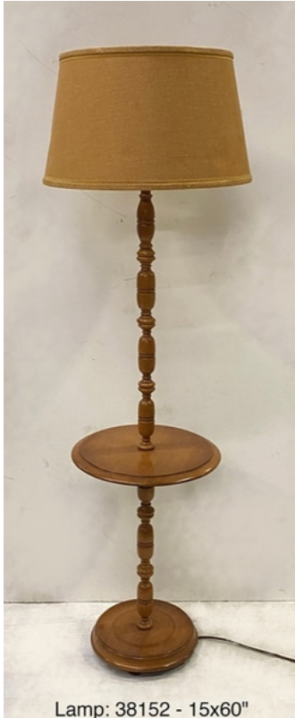
Lamp: 38152 - 15x60"