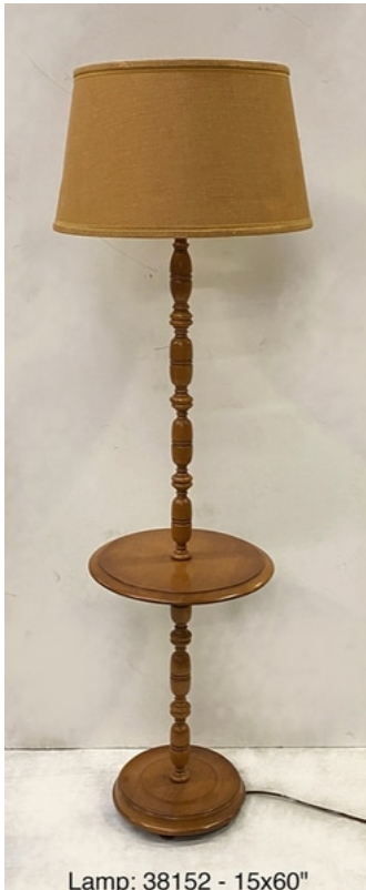
Lamp: 38152 - 15x60"